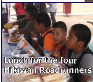
Lunch for the four Hikiwan Roadrunners

before, his Hikiwan Roadrunners won 5 of 8 games (in the 8 to 11 age group, they were only 7 to 9 yrs). They had never played as a team before.